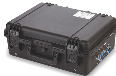
◀ Robust Pelican Storm Case